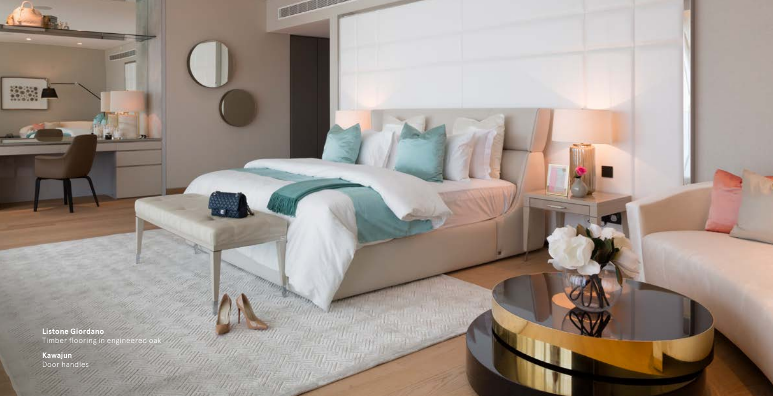
Listone Giordano Timber flooring in engineered oak Kawajun Door handles