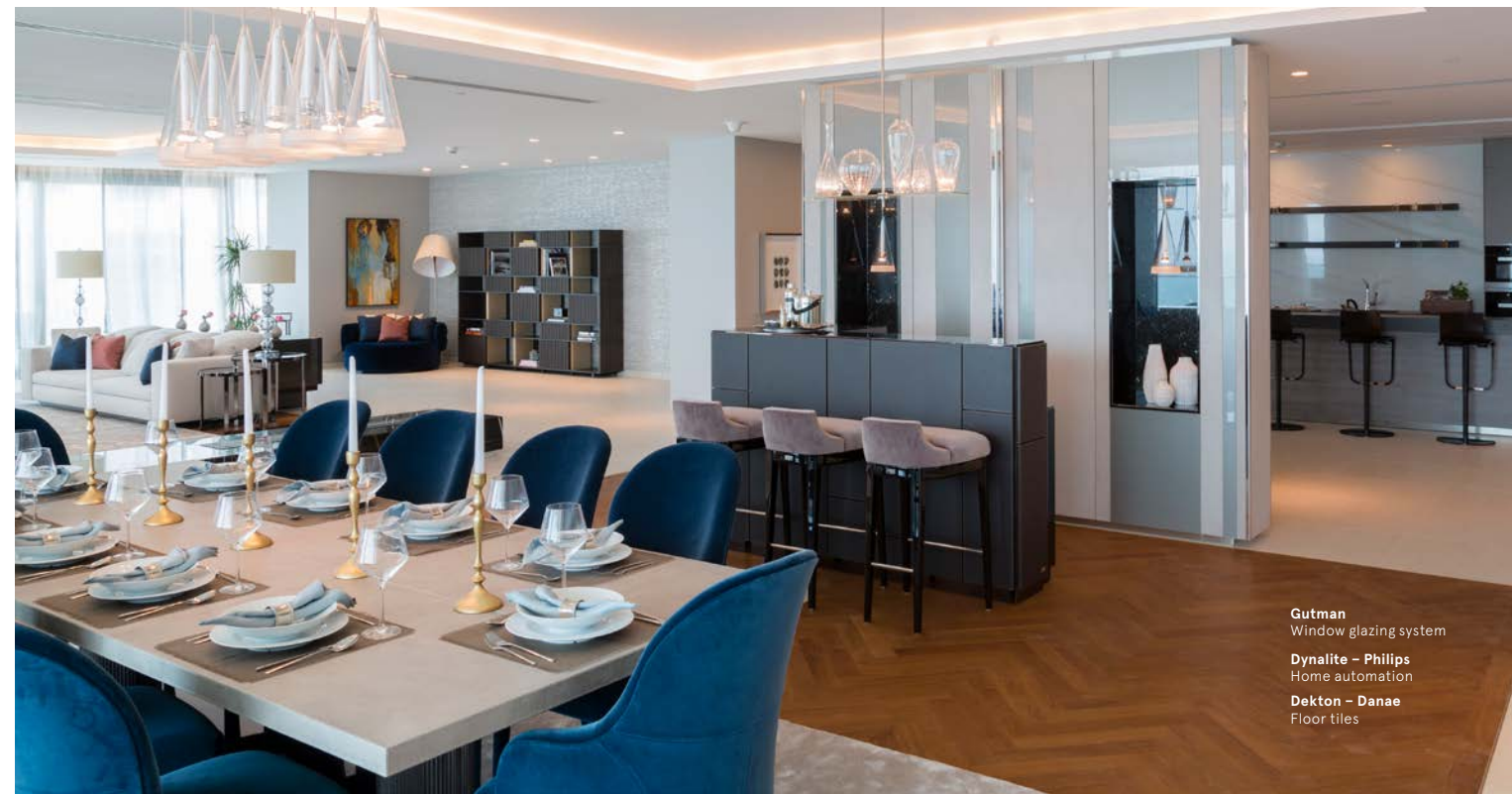
Gutman Window glazing system Dynalite - Philips Home automation Dekton - Danae Floor tiles