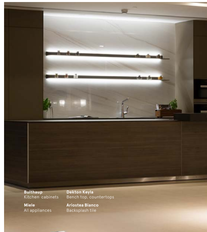
Bulthaup Kitchen cabinets Dekton Keyla Bench top, countertops Miele All appliances Ariostea Bianco Backsplash tile