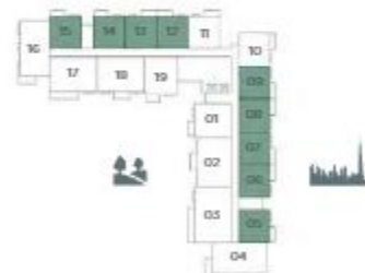
LEVEL 2 - 6