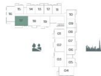
LEVEL 2 - 6