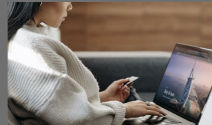
Pay with Points