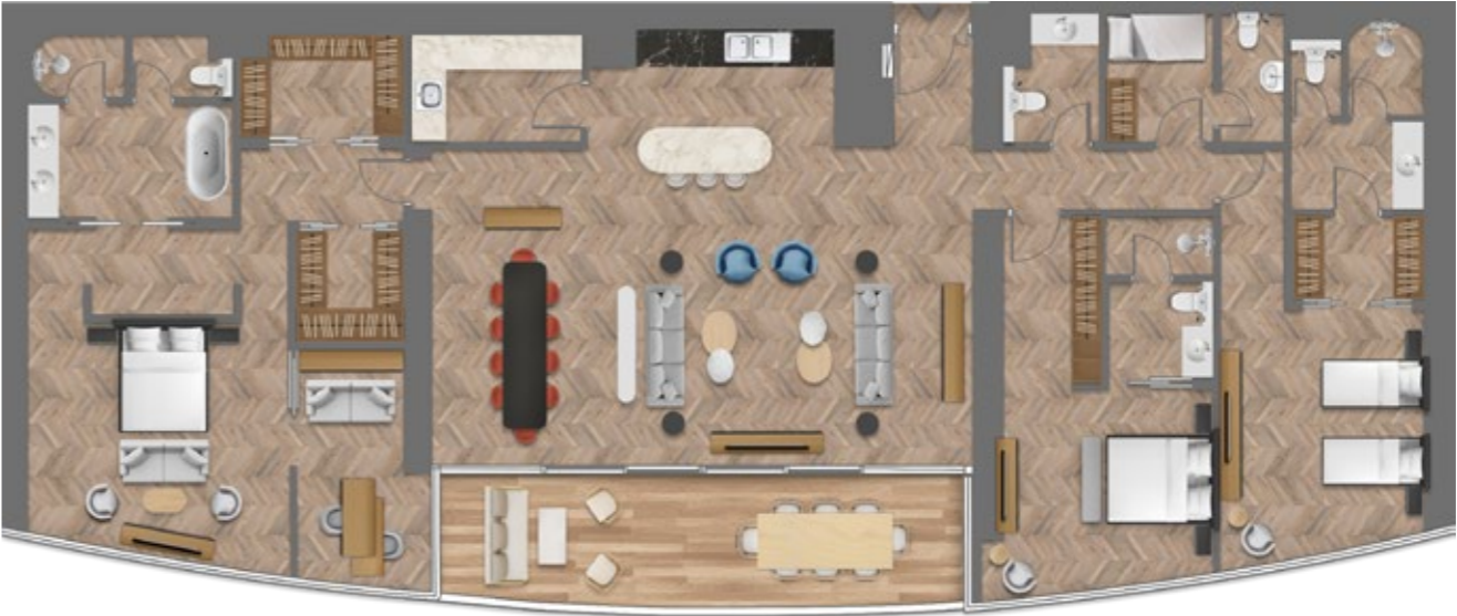
3 BEDROOM APARTMENT, TYPE C