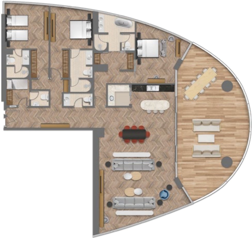
3 BEDROOM APARTMENT, TYPE B