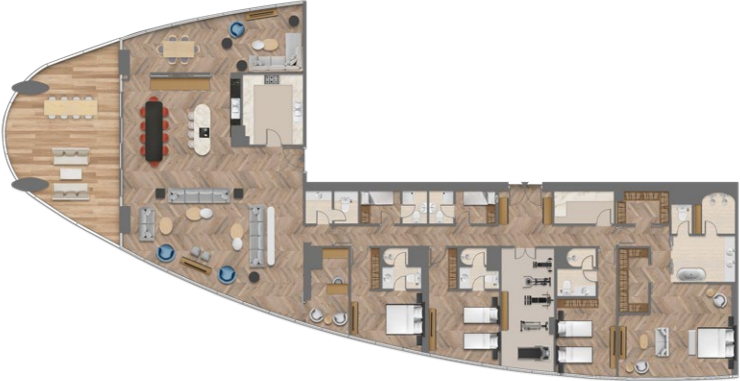
4 BEDROOM APARTMENT, SIMPLEX