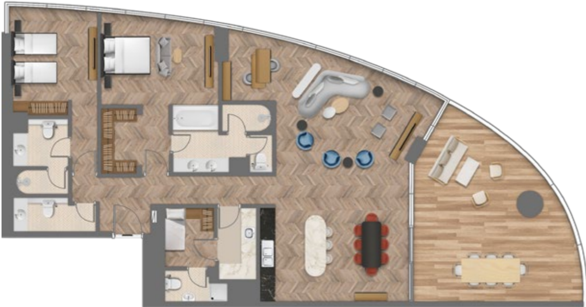
2 BEDROOM APARTMENT, TYPE A