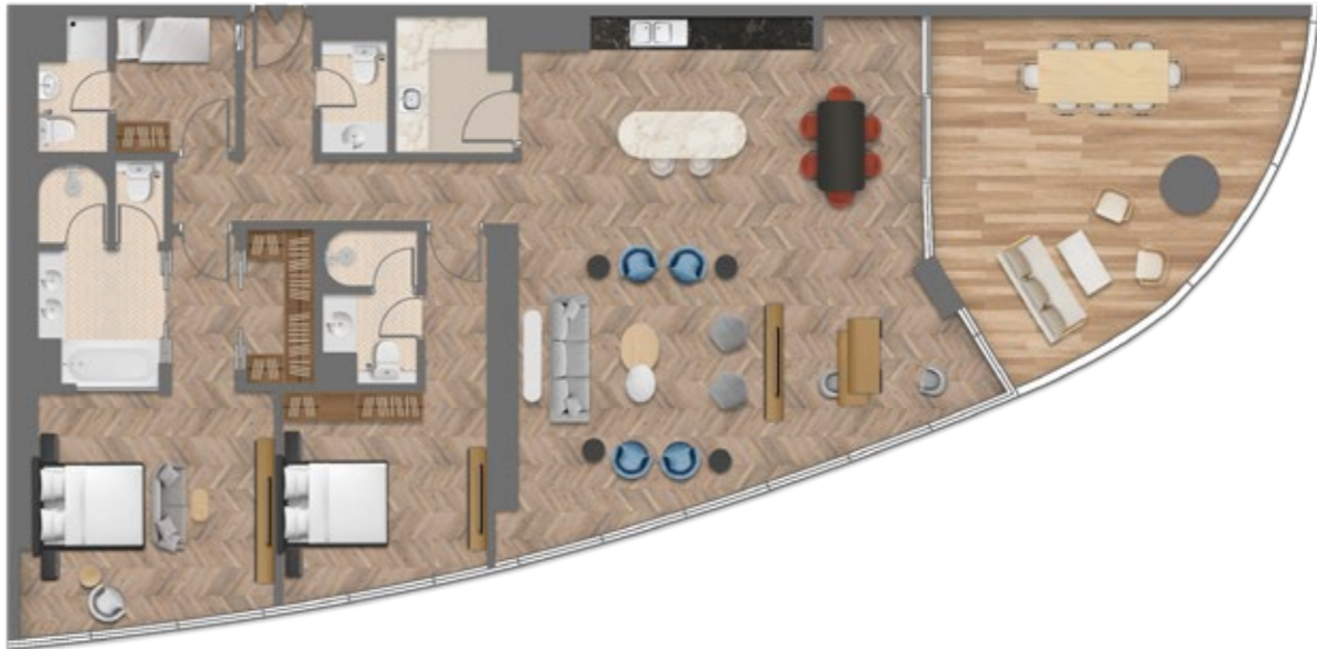
2 BEDROOM APARTMENT, TYPE B