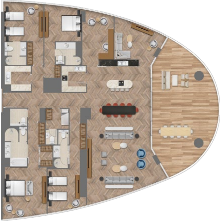
4 BEDROOM APARTMENT, TYPE A