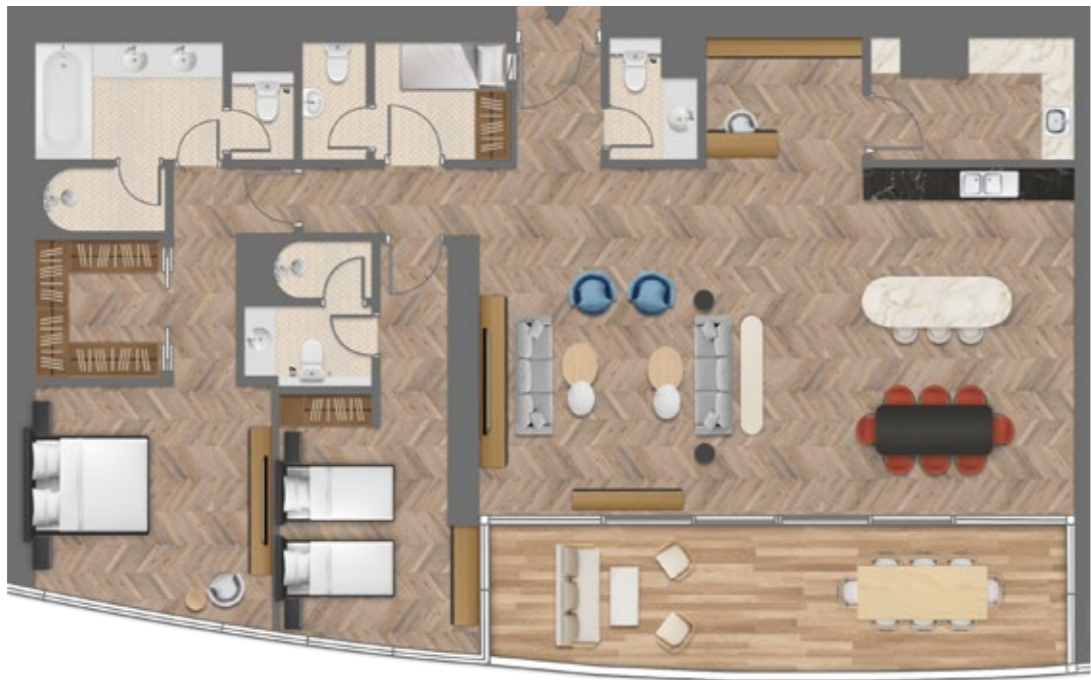
2 BEDROOM APARTMENT, TYPE C