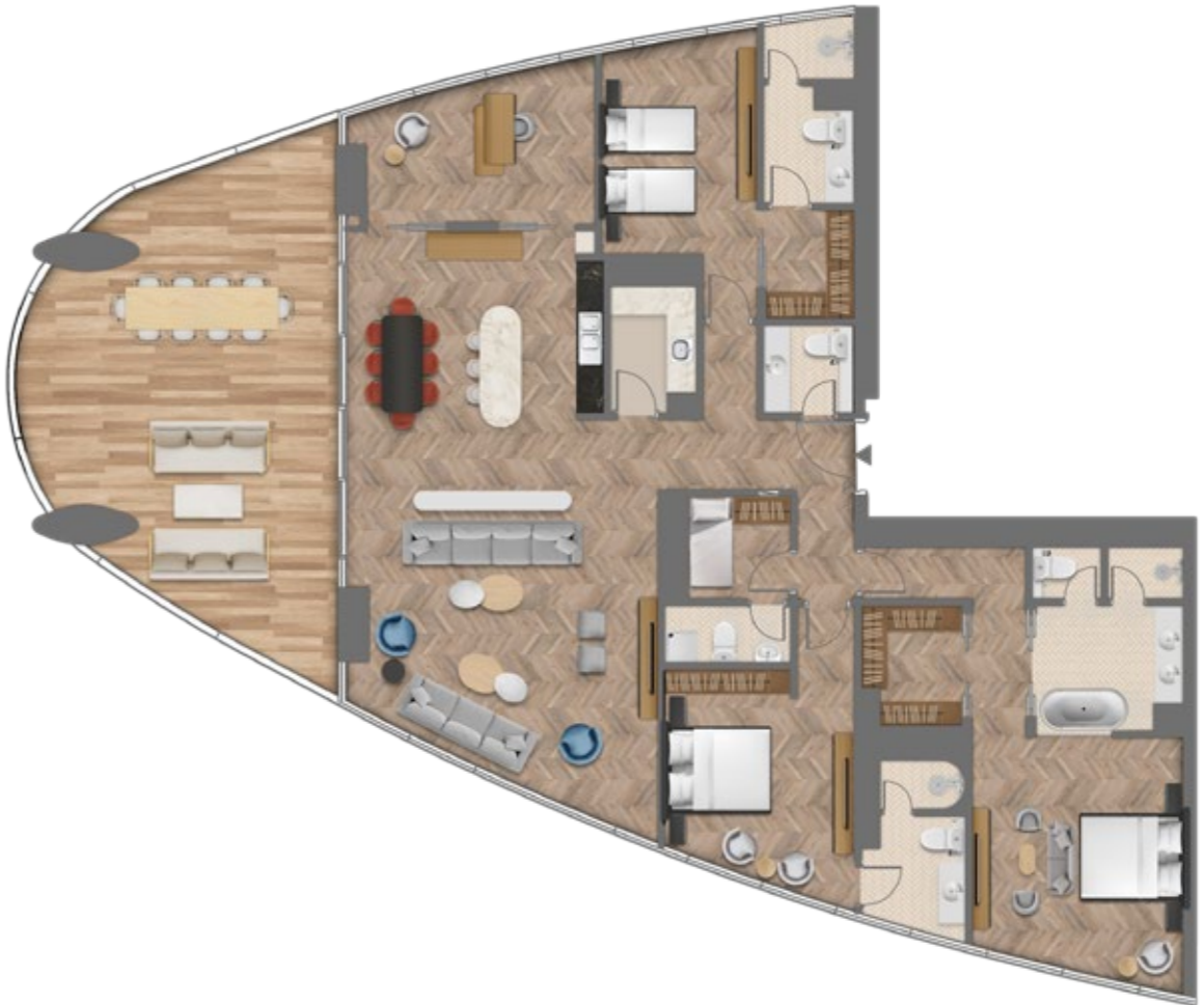
3 BEDROOM APARTMENT, TYPE A