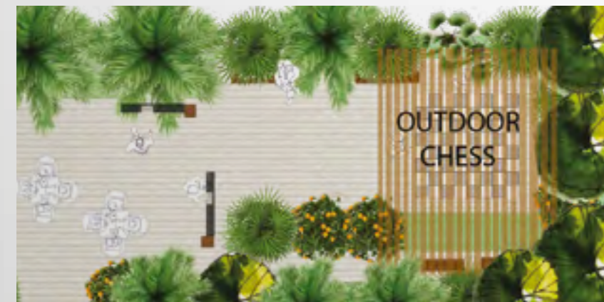
Extracted from the concept design idea

A timeless game enjoyed by all generations. You don't need backyards or large patios, the possibilities are endless at Azizi Riviera.