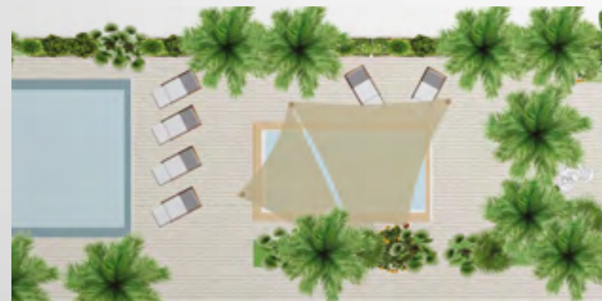
Extracted from the concept design idea

Just like anything else, swimming pools come in all different designs, sizes, shapes and are used for various purposes. Azizi Riviera has a shaded swimming pool to keep your kids engaged and entertained when the sun is shining and the weather is hot.