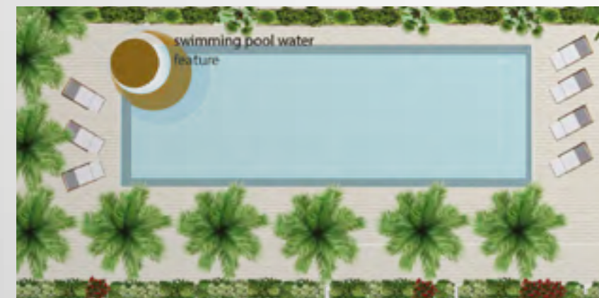
Extracted from the concept design idea

A large swimming pool to unwind with the whole family, plenty of space, an abundance of natural light and state of the art facility set the perfect stage for a tough workout, or an invigorating morning stretch.