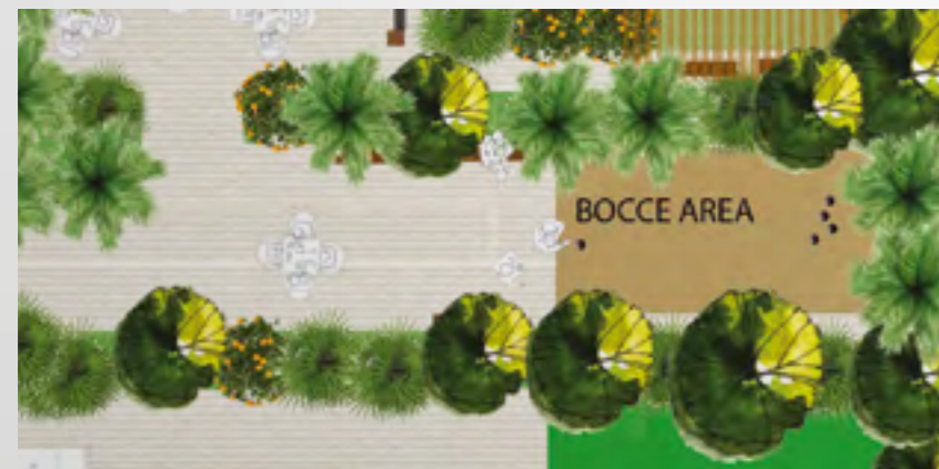
Extracted from the concept design idea

Bocce is loved by people of all ages. Competitors or teams lob a total of eight bocce balls as close as possible to a smaller white ball called the 'pallino.' It is estimated that the game originated in 5200 B.C. It is still played today all over the world - the second most played ball sport behind soccer. Azizi Riviera is the best place to play bocce in the Meydan area.