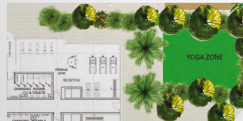
Extracted from the concept design idea

India may be the home of yoga, but right now Dubai is among the world's greatest hubs for this super-healthy practice. Of course it's not surprising that you can find so many different styles of yoga in Dubai, but the city has a reputation for diversity to uphold. There truly is something for everyone and anyone, even those who prefer to take outdoor fitness classes can try outdoor yoga at Azizi Riviera. It will change your life!