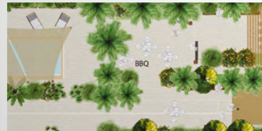
Extracted from the concept design idea

Live the ultimate lifestyle in Dubai. High up on your own rooftop terrace, you are easily able to entertain guests or relax alone on a sun-lounger.