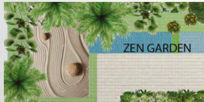
Extracted from the concept design idea

The sand or gravel in a Zen garden represent the sea or ocean and is used instead of water. Azizi Riviera Zen garden is carefully designed to create the impression of waves on the surface of a body of water. The rocks themselves represent islands or rock formations jutting out from the water.