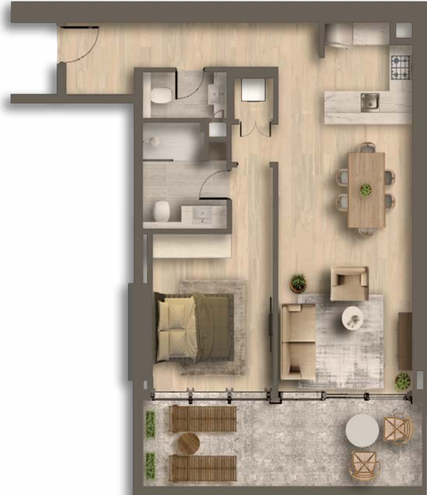
Type B 1,025 sq.ft