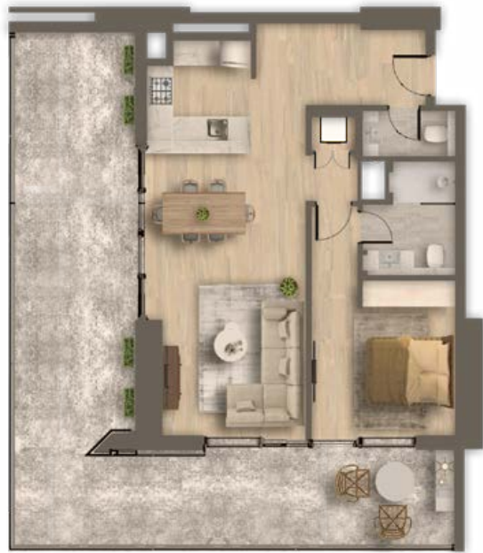
Type B2 878 sq.ft