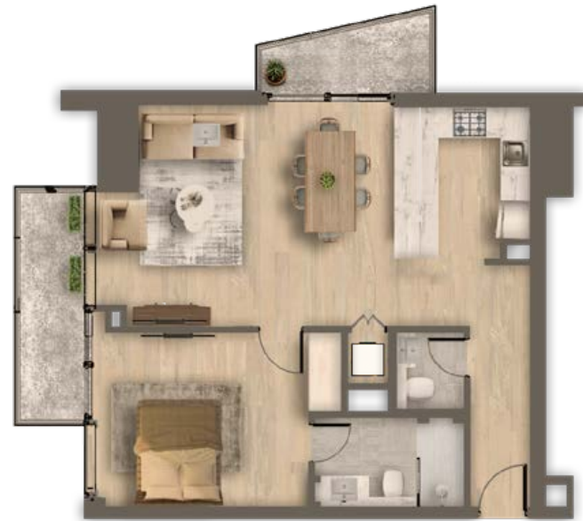
Type C From 847 sq.ft to 927 sq.ft