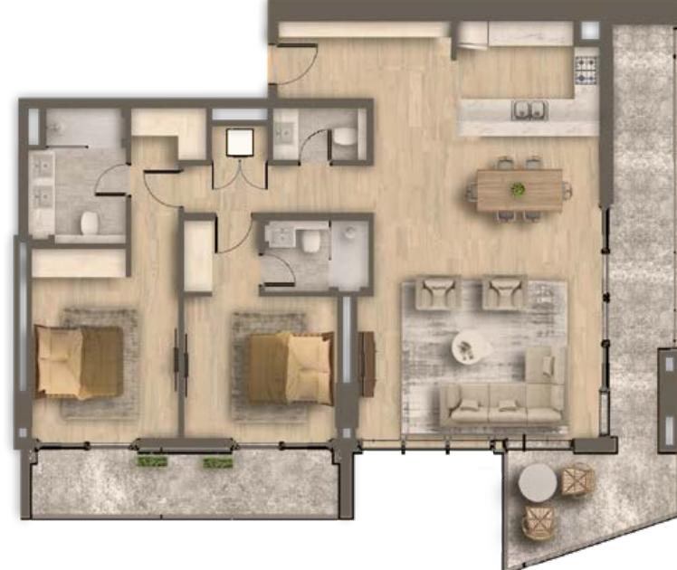
Type B From 1,467 sq.ft to 1,677 sq.ft