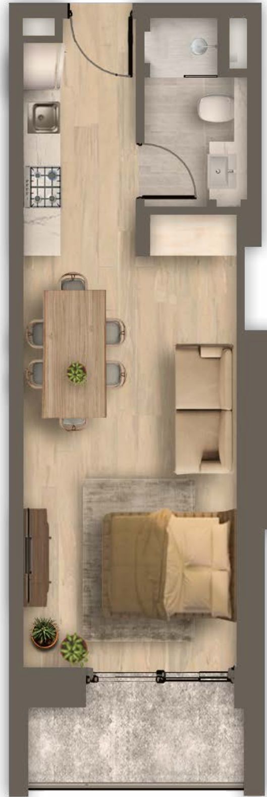
Type B 457 sq.ft