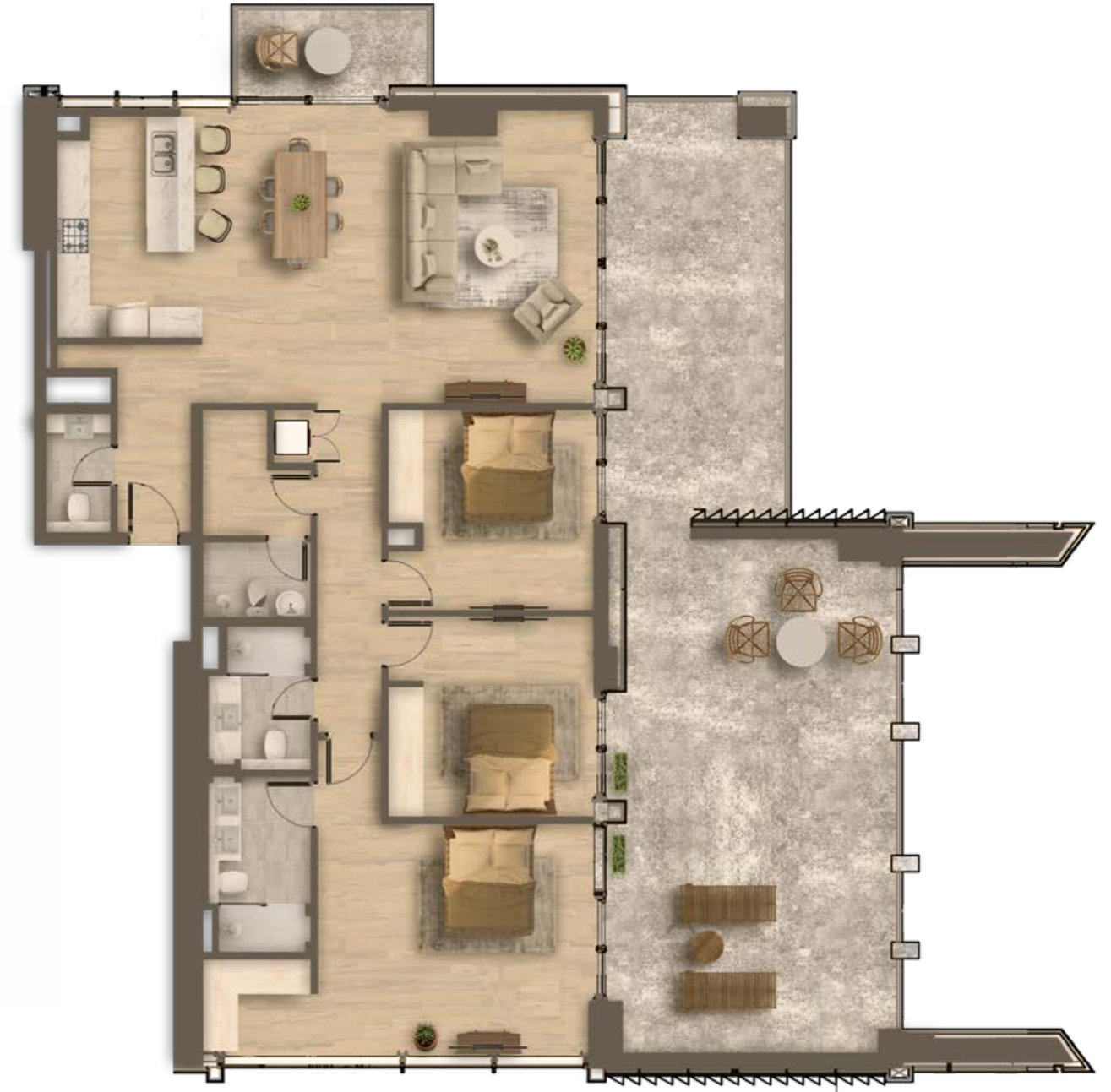
Type C 2,560 sq.ft