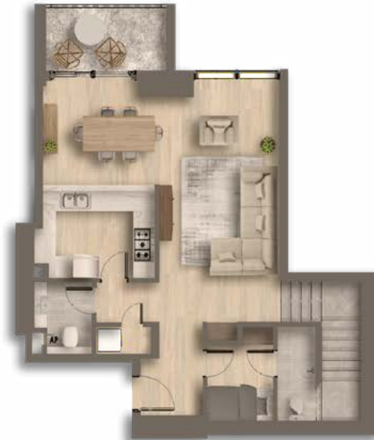
Type DPC 1,737 sq.ft