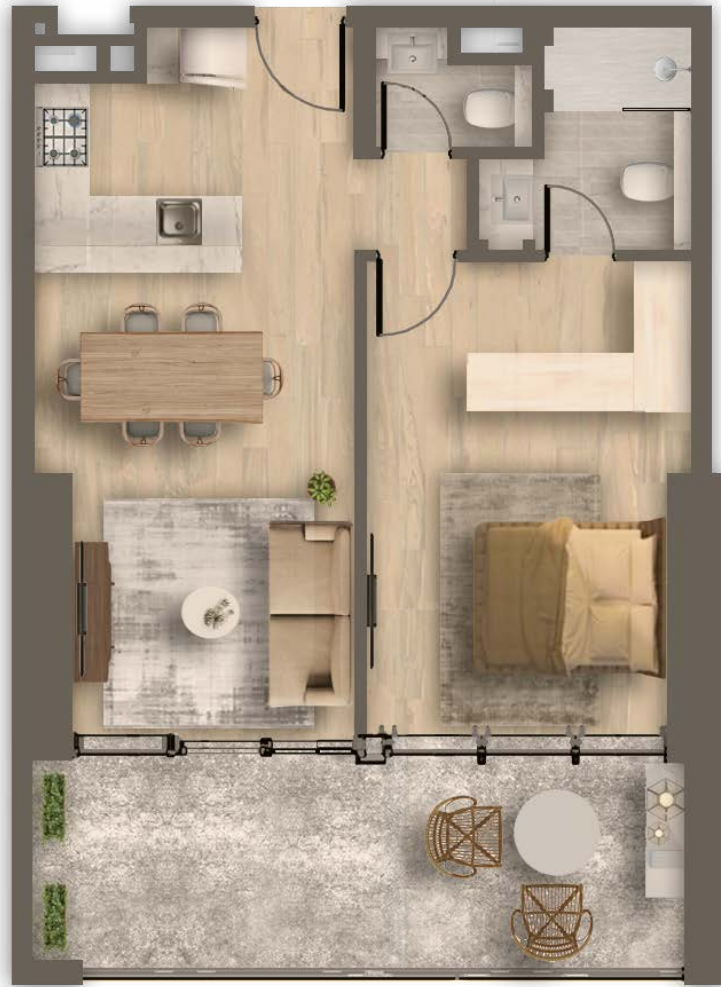
Type A From 654 sq.ft to 796 sq.ft