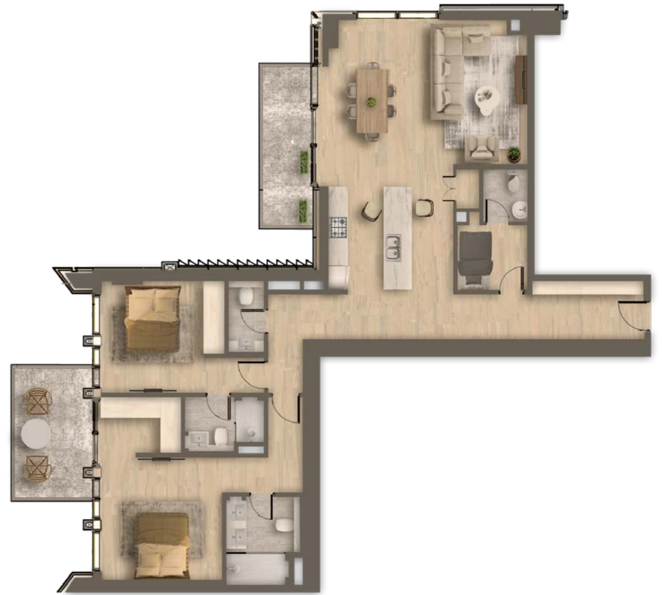
Type M From 1,595 sq.ft to 1,643 sq.ft