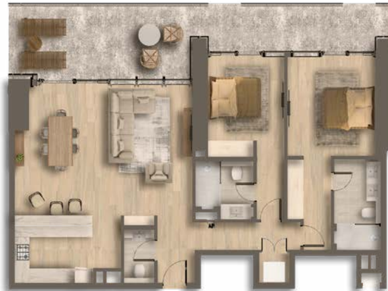
Type C1 From 1,470 sq.ft to 1,617 sq.ft