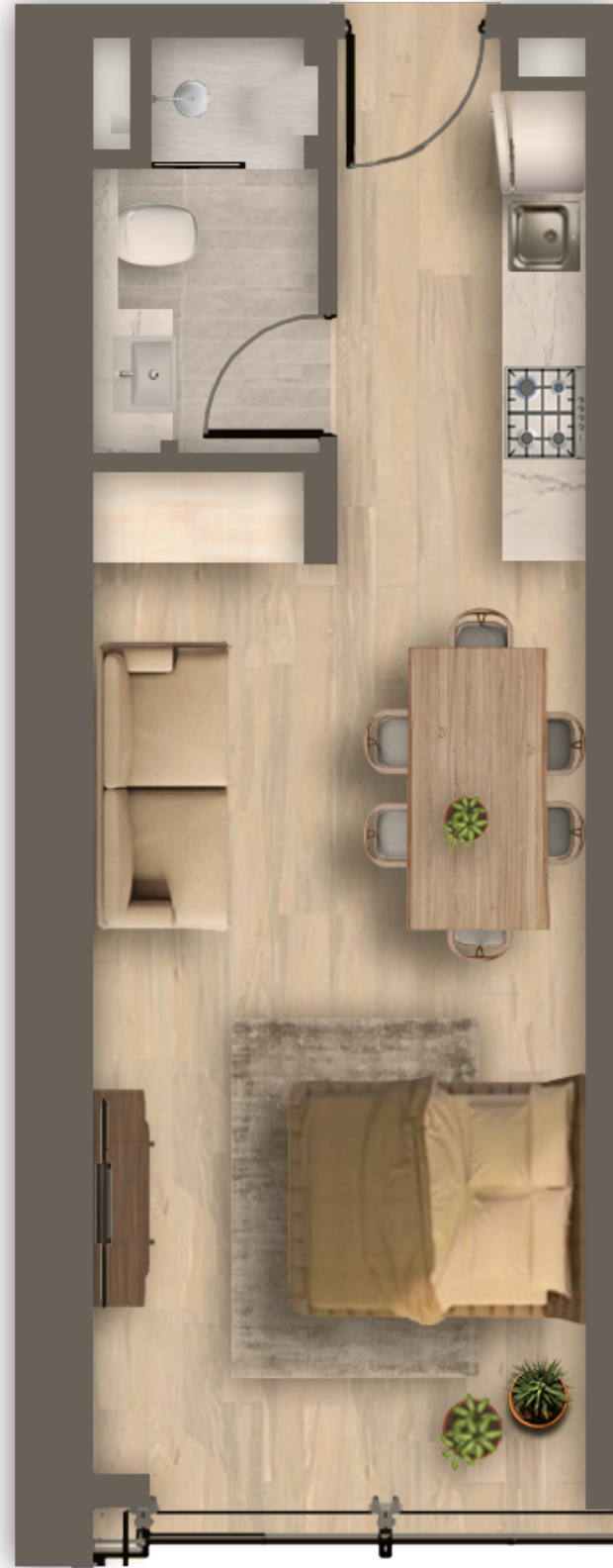
Type A 417 sq.ft