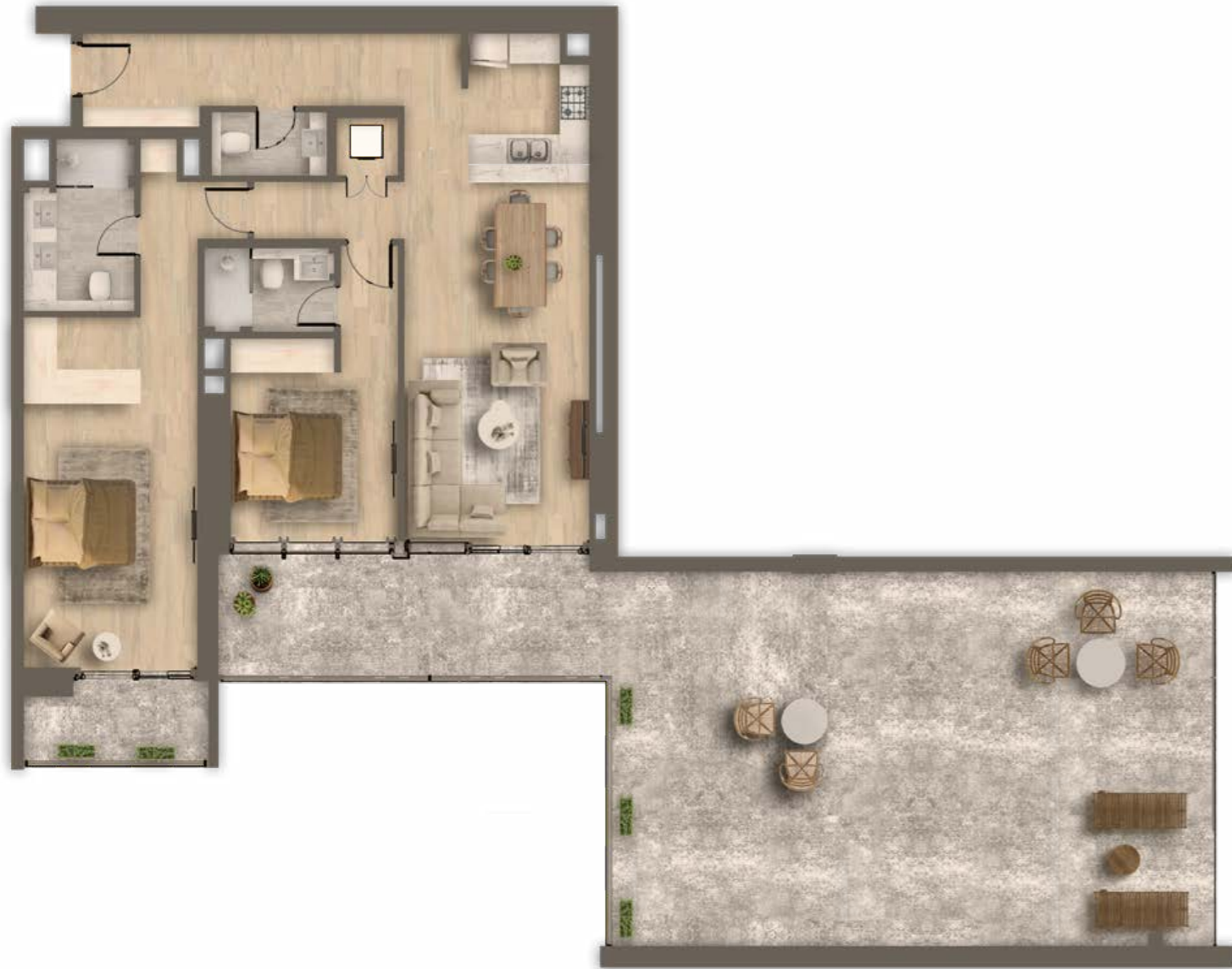
Type E 2,391 sq.ft