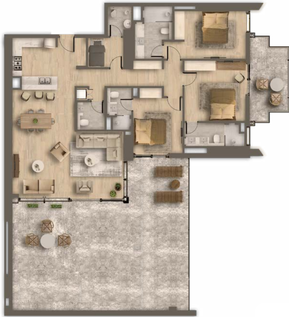
Type D 2,769 sq.ft