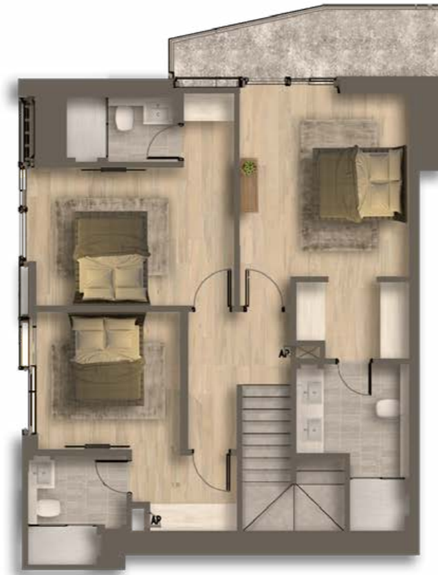
Type DP 2,344 sq.ft