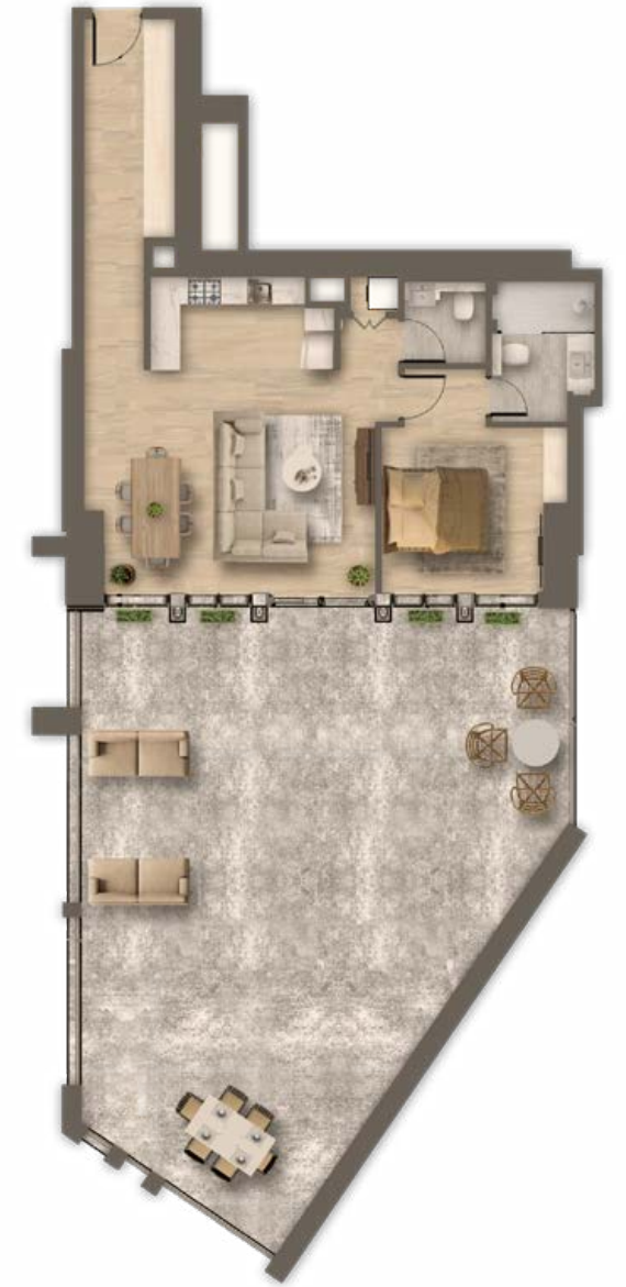
Type E From 900 sq.ft to 1,829 sq.ft