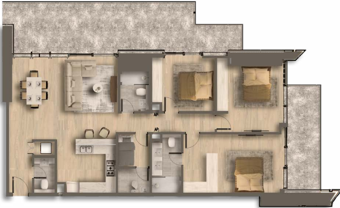
Type A From 1,674 sq.ft to 1,923 sq.ft