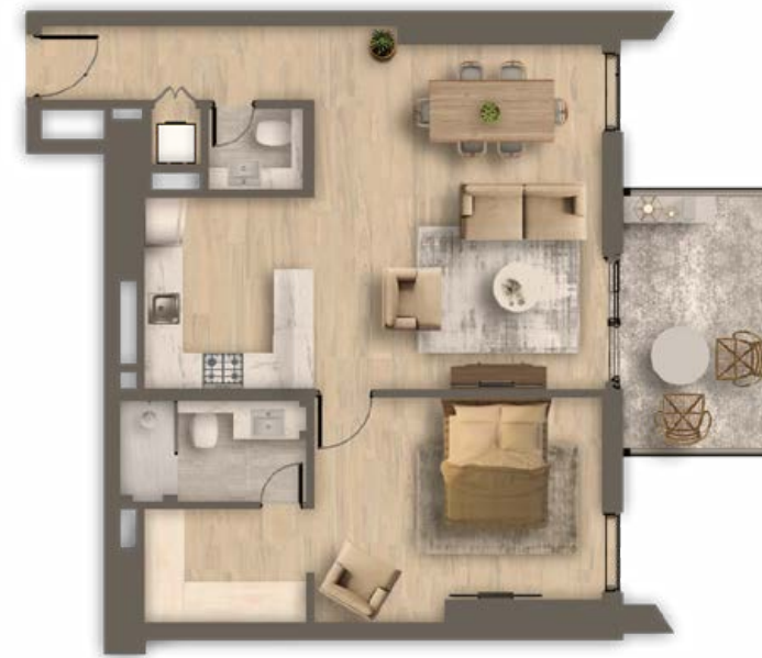
Type D 920 sq.ft