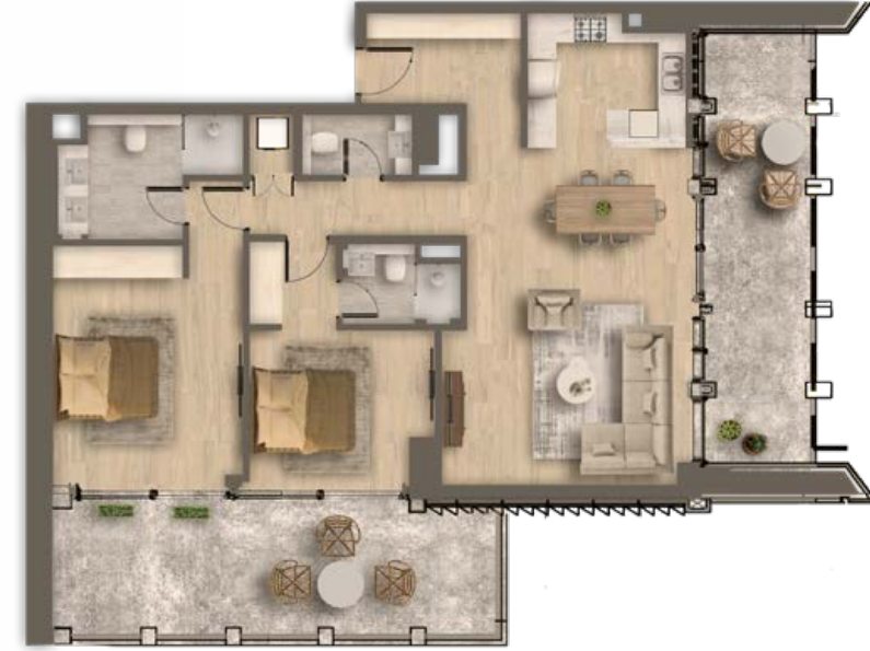
Type D From 1,275 sq.ft to 1,698 sq.ft