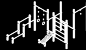
Outdoor Calisthenics Park