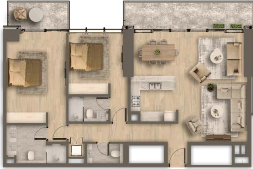
Type A 1,375 sq.ft