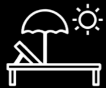
Outdoor Lounging Pool