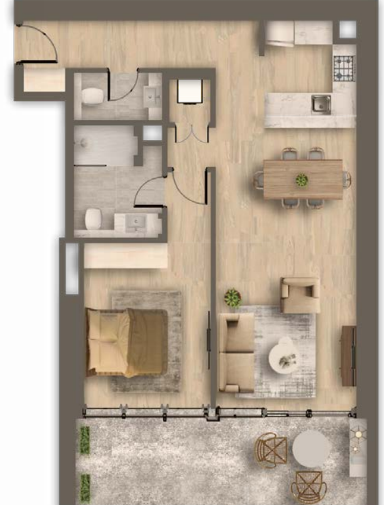
Type B1 From 996 sq.ft to 1,013 sq.ft