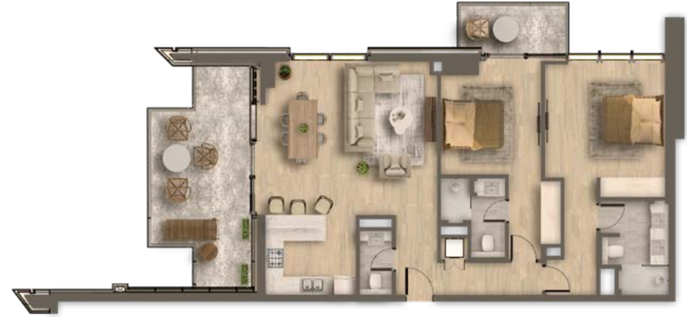
Type C From 1,321 sq.ft to 1,487 sq.ft