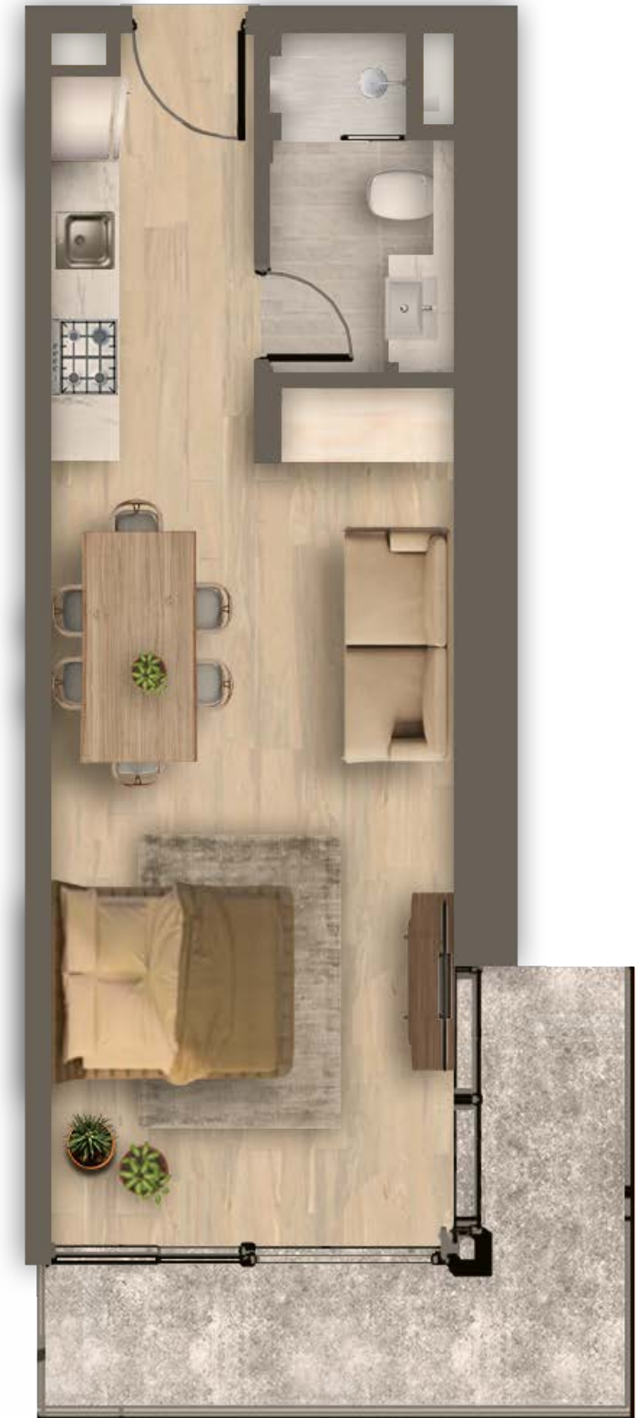
Type SB 455 sq.ft