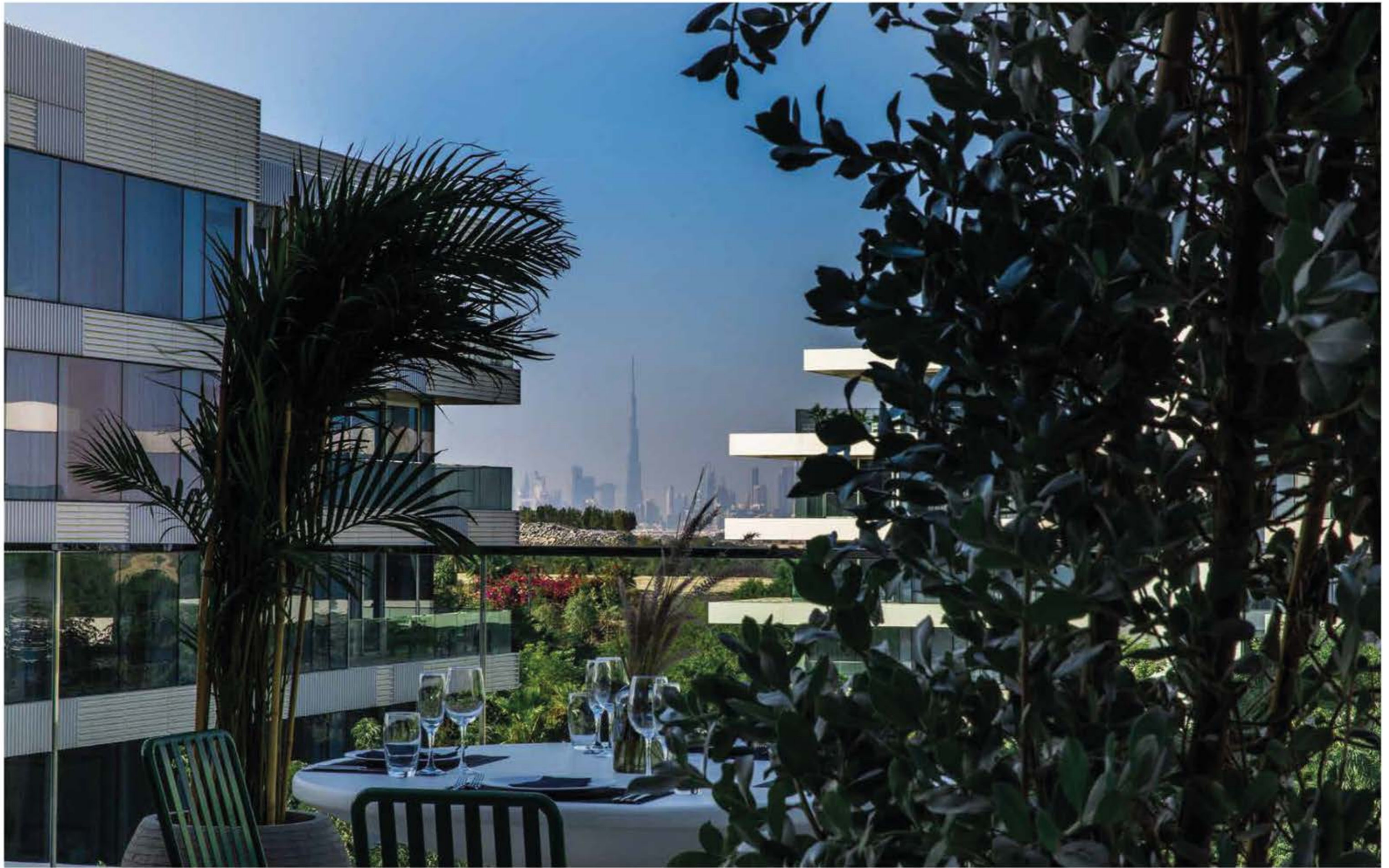
HIDEOUT LOUNGE & RESTAURANT