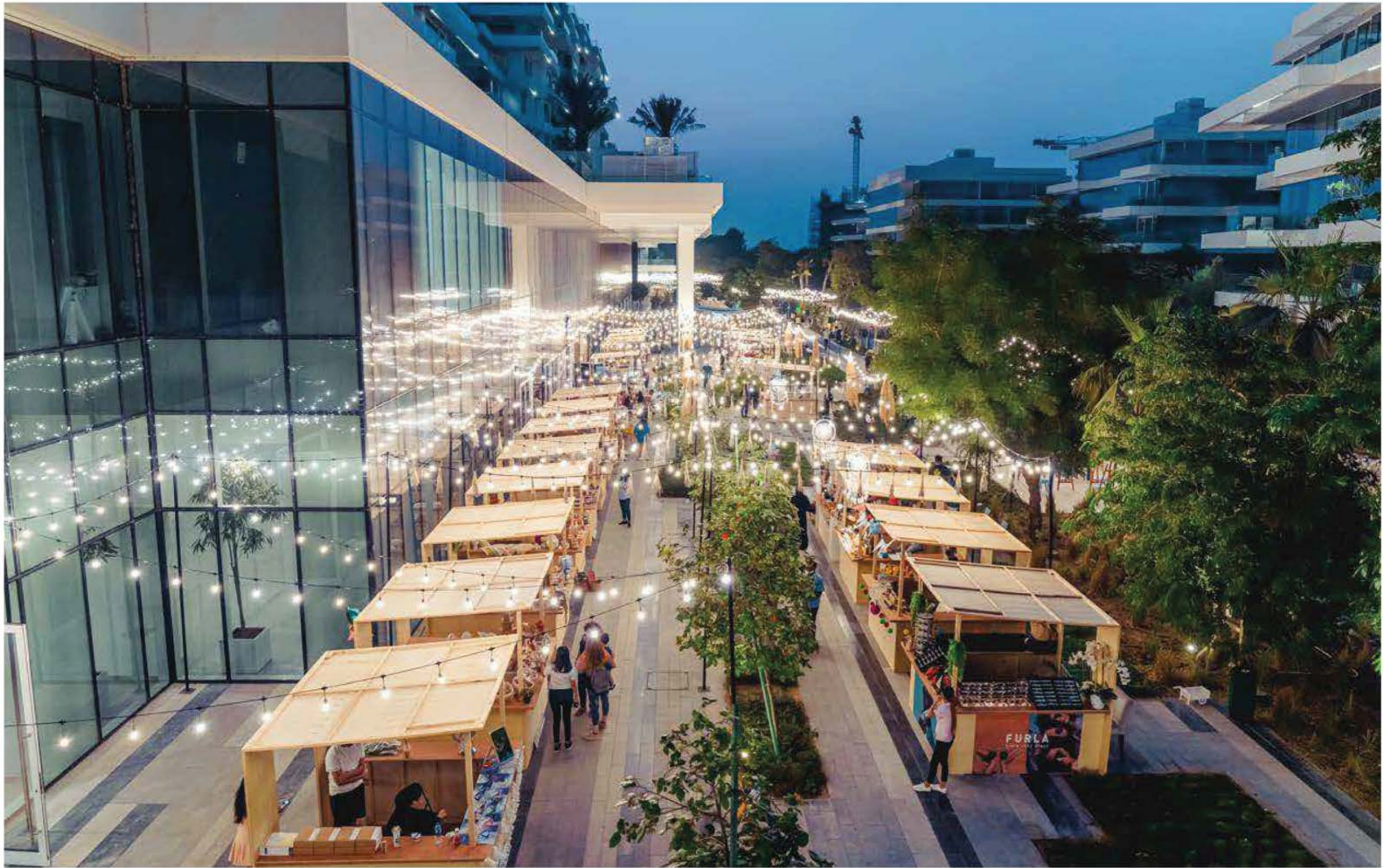
AL BARARI LE MARCHE 2021