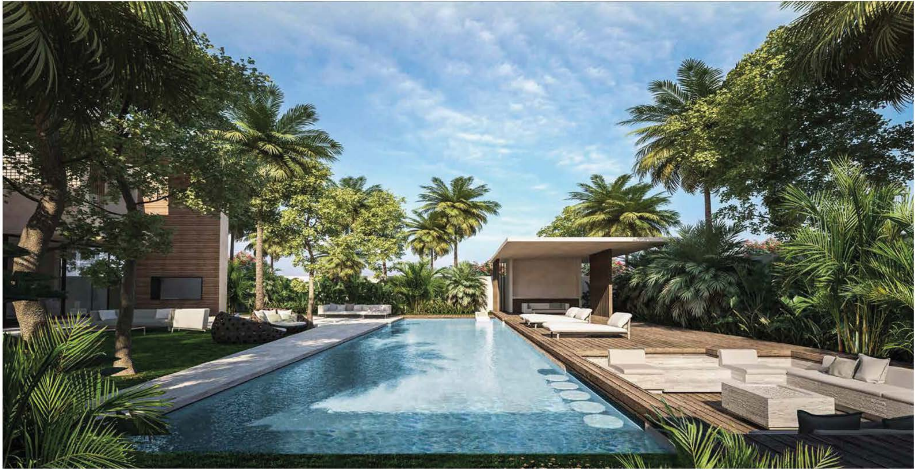
This villa offers a distinct quality of space enhanced by visual connections from the inside to the outside and between all the terraces on different levels.