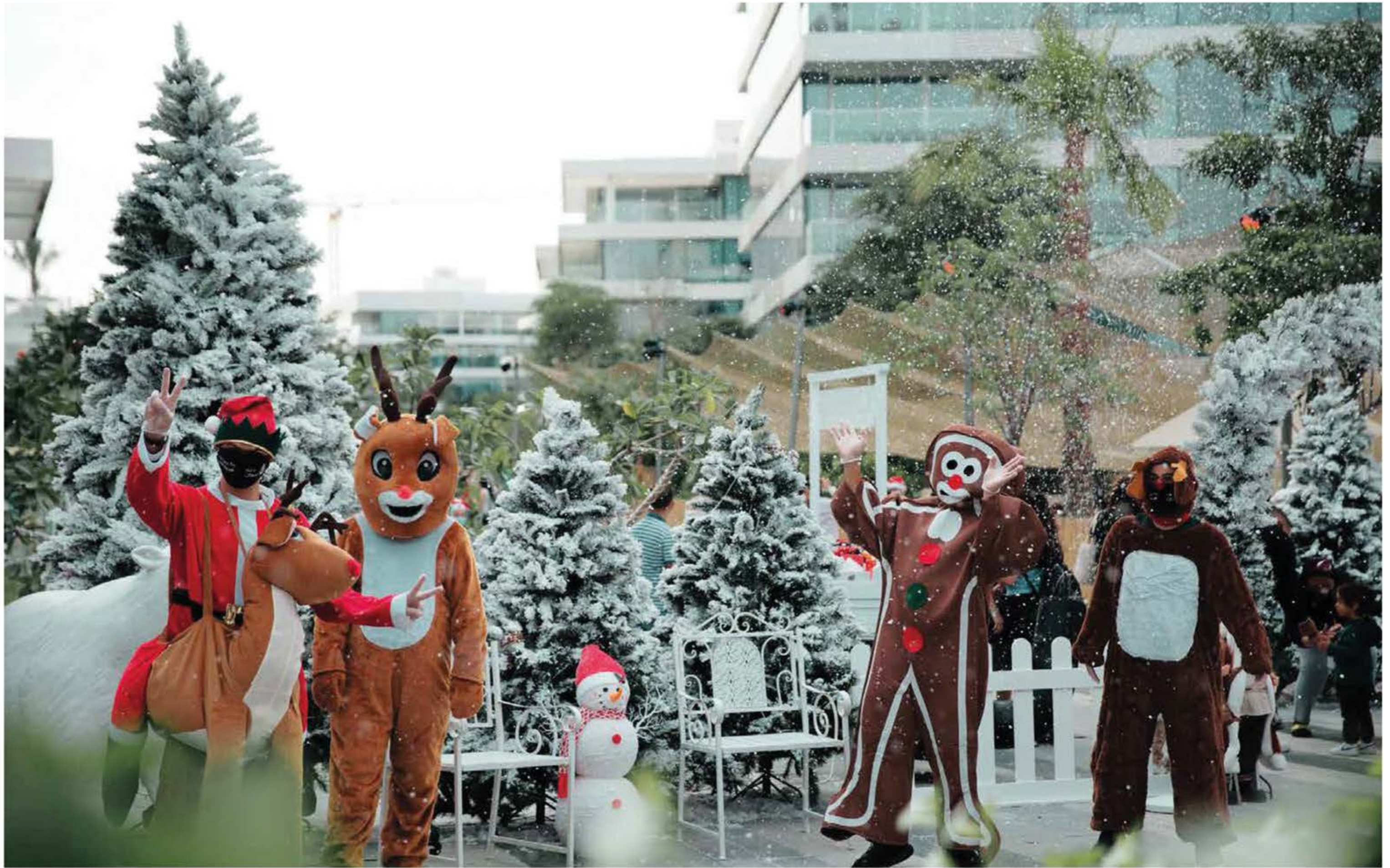
AL BARARI WINTER WONDERLAND 2020