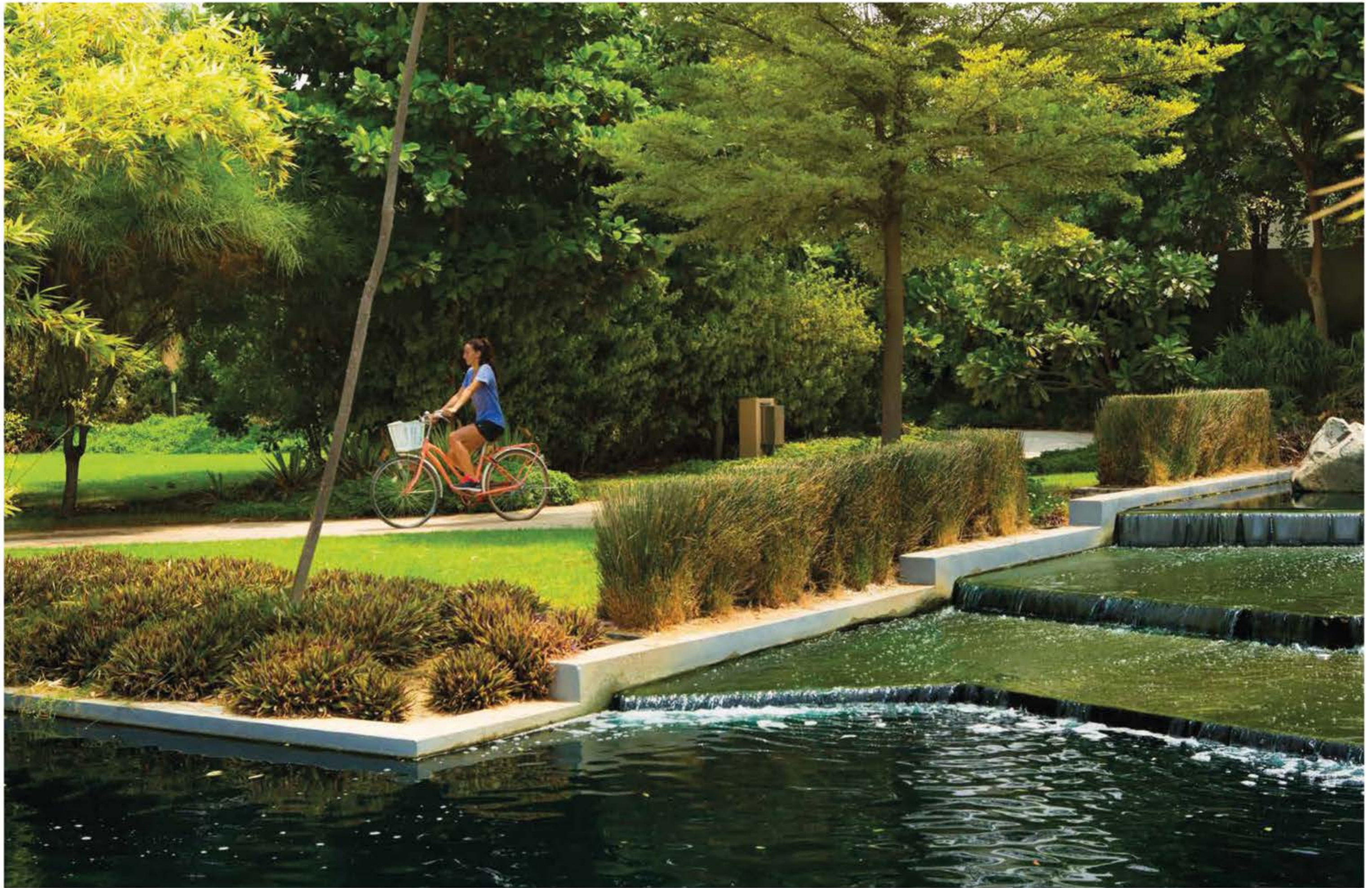
AL BARARI 6 KM CYCLING TRACK