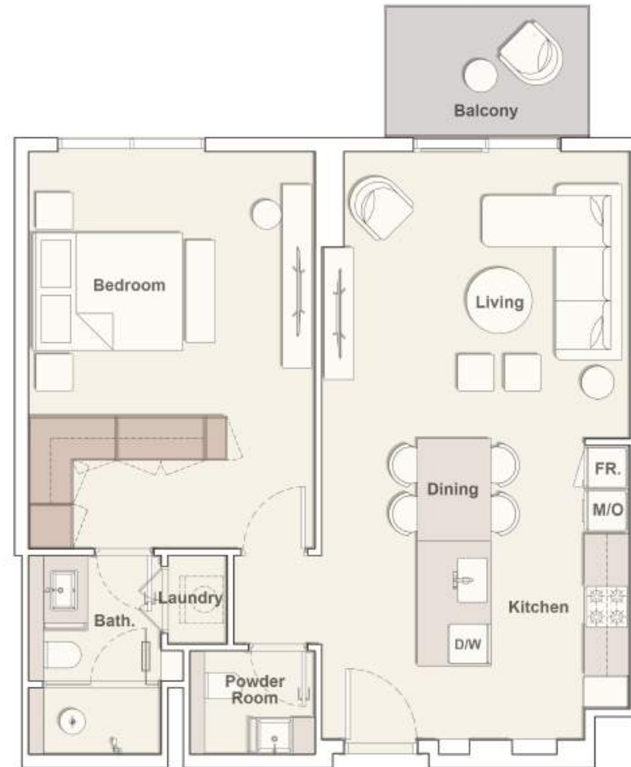
1 BEDROOM TYPE D