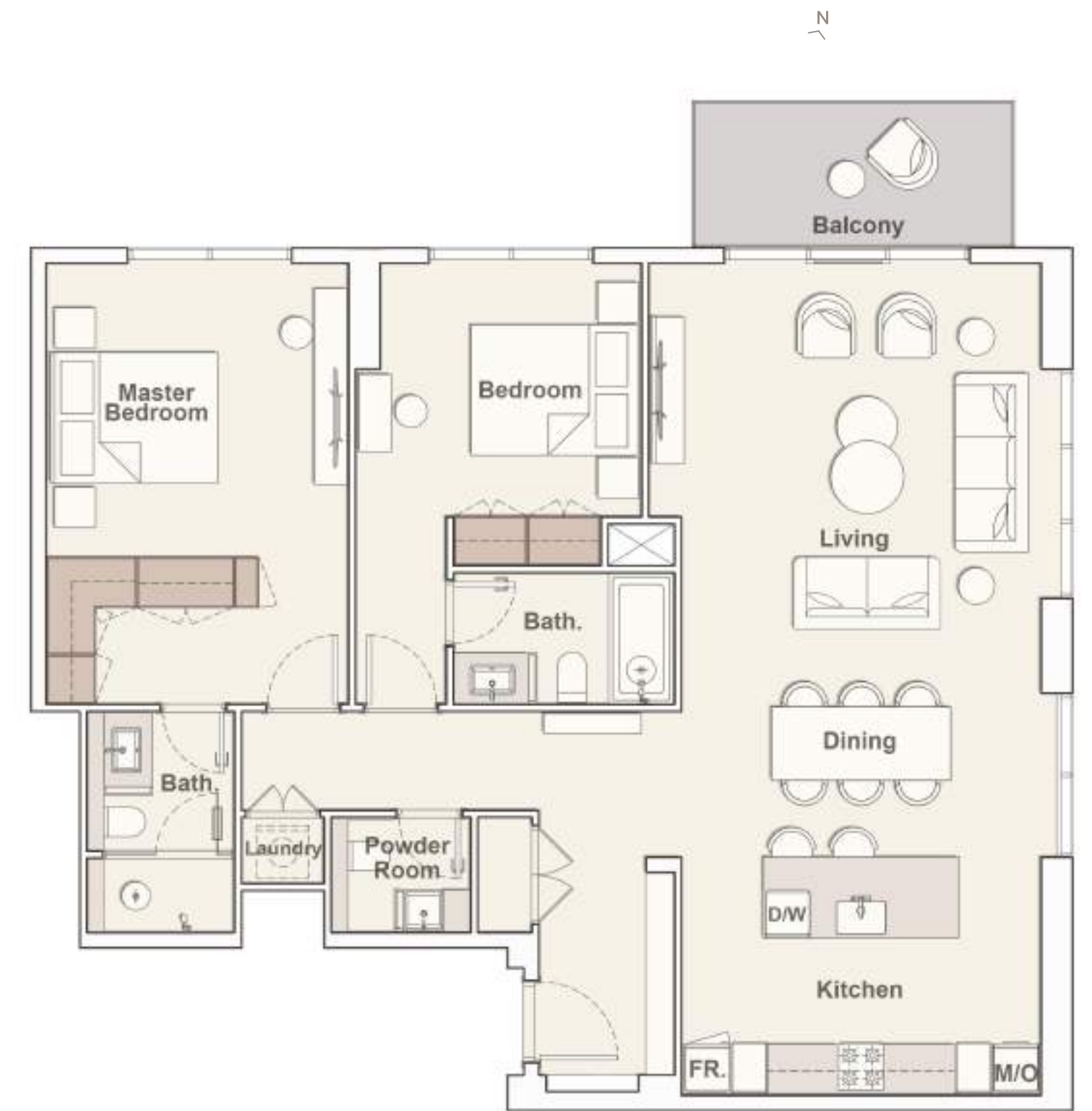
2 BEDROOM TYPE D