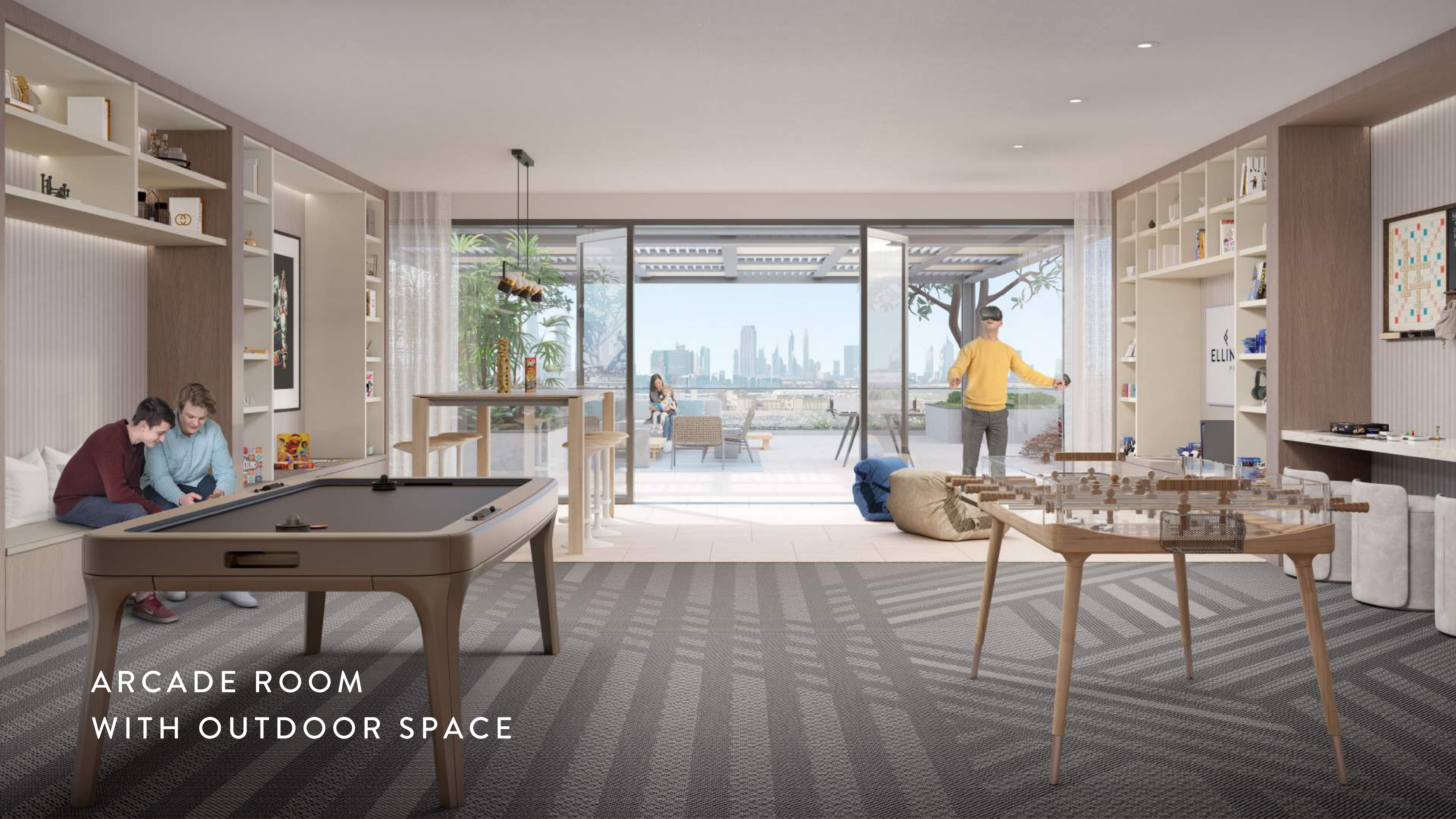
ARCADE ROOM WITH OUTDOOR SPACE