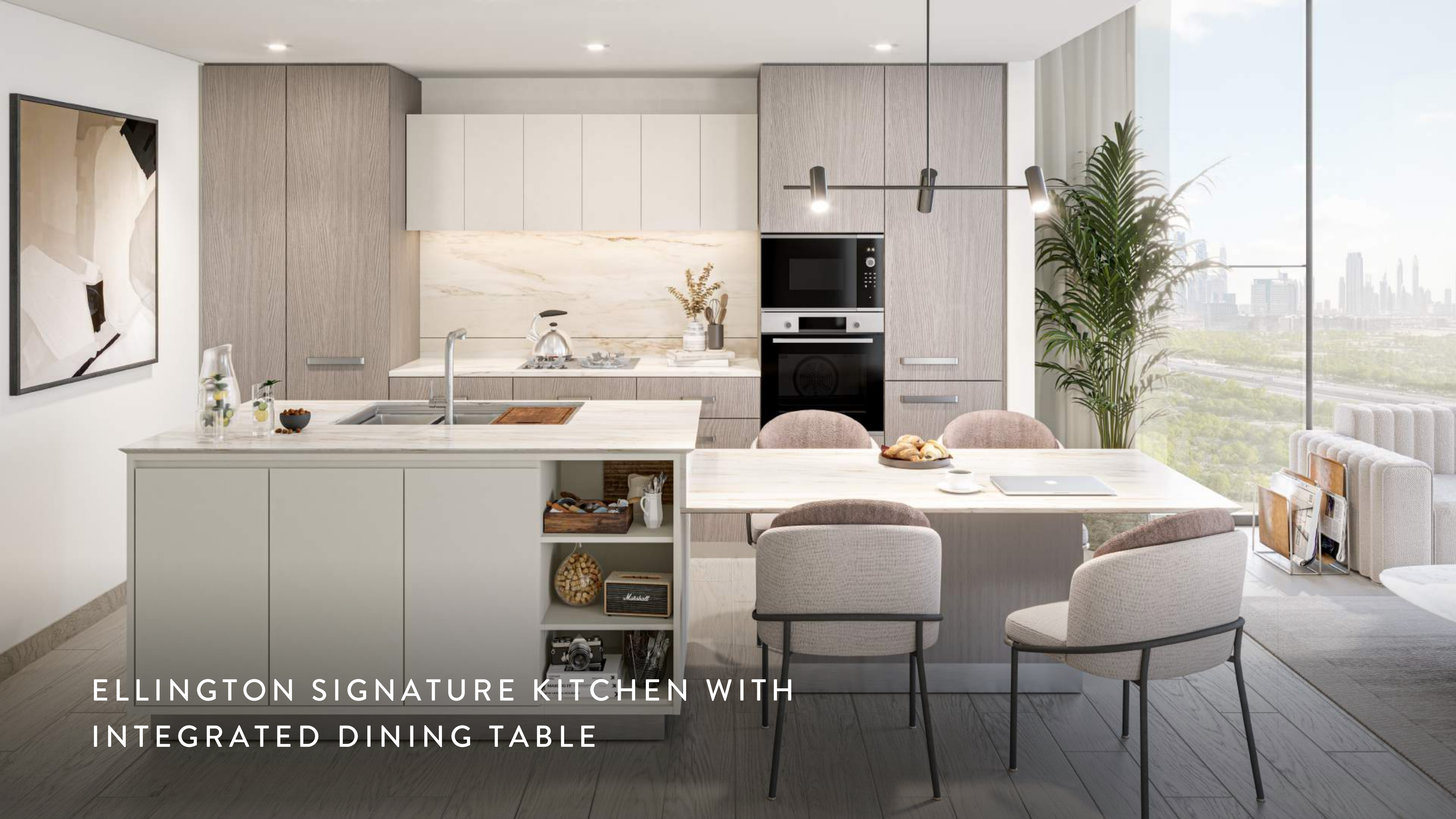
ELLINGTON SIGNATURE KITCHEN WITH INTEGRATED DINING TABLE