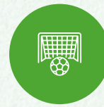
Mini football court