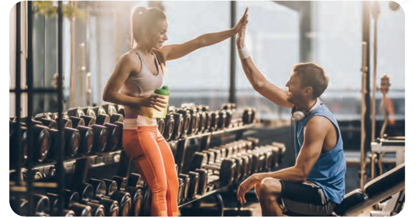
Gyms, outdoor wellness and fitness areas