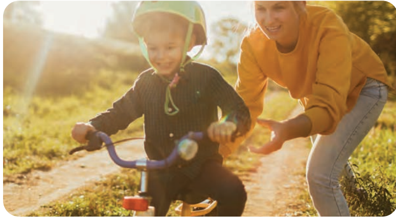
4.5 km of pedestrian tracks and 5.2 km of cycling trails