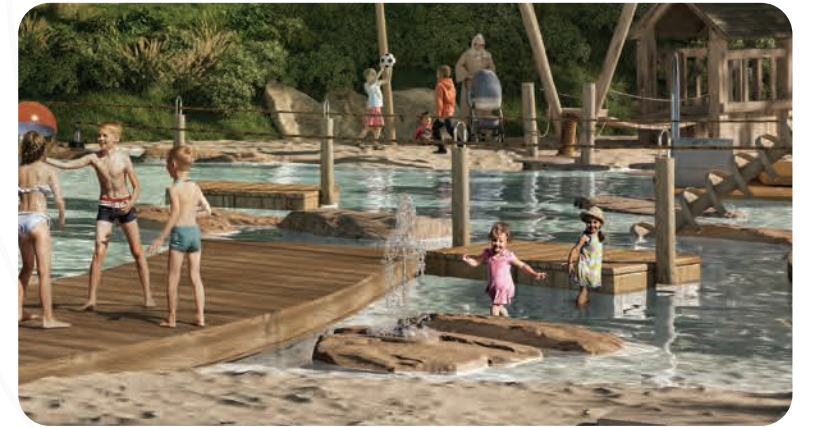
Swimming pools, splash pads and kids' play areas