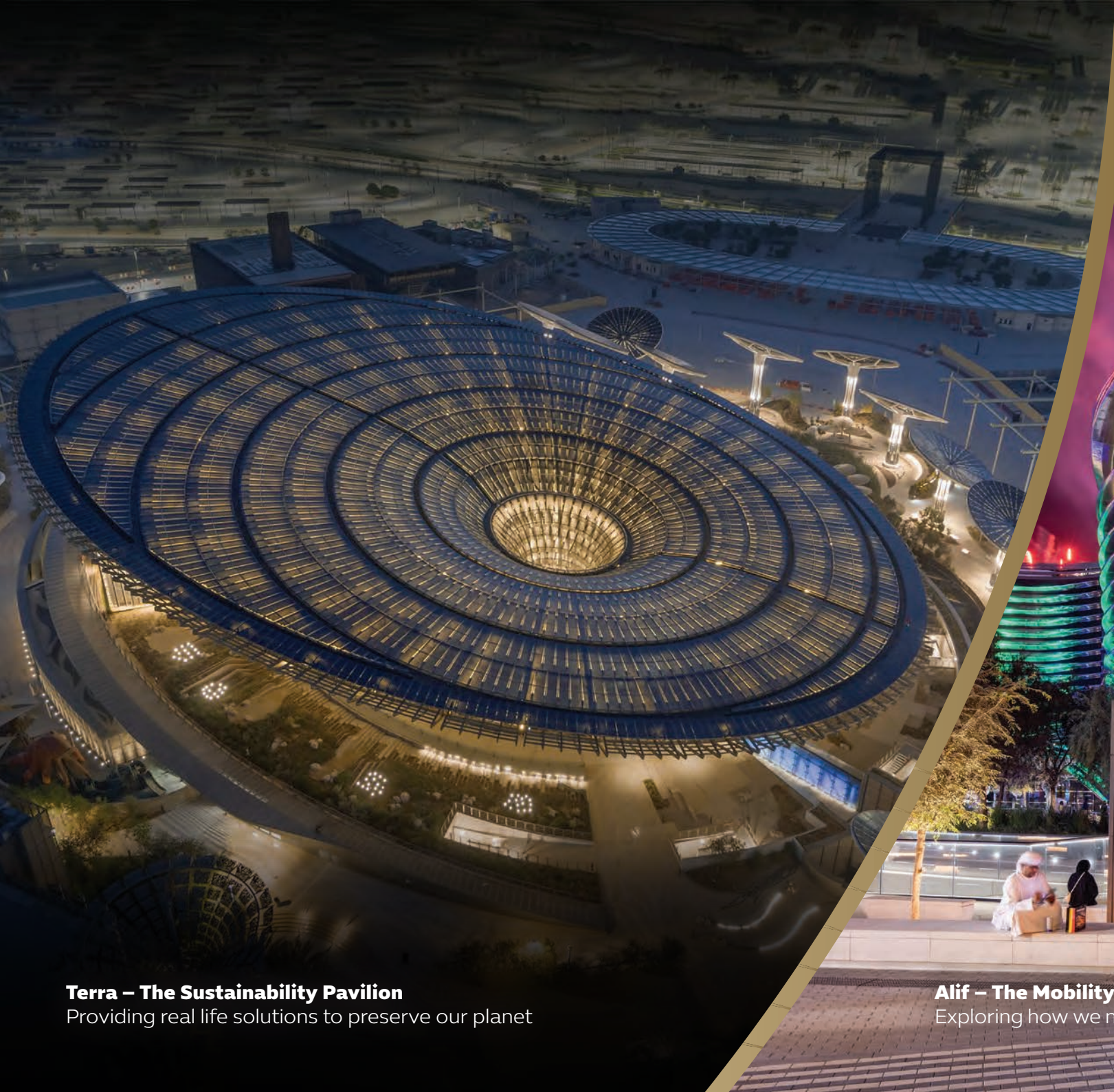
Terra – The Sustainability Pavilion Providing real life solutions to preserve our planet