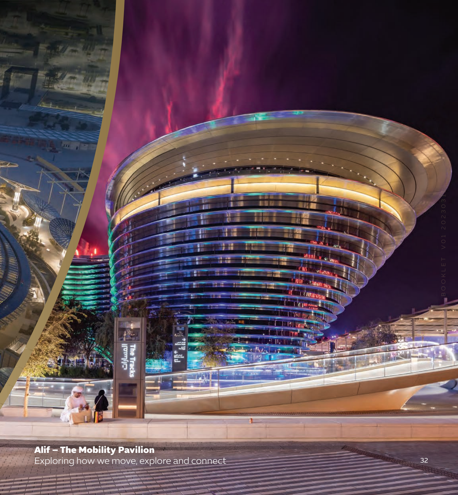
Alif – The Mobility Pavilion Exploring how we move, explore and connect