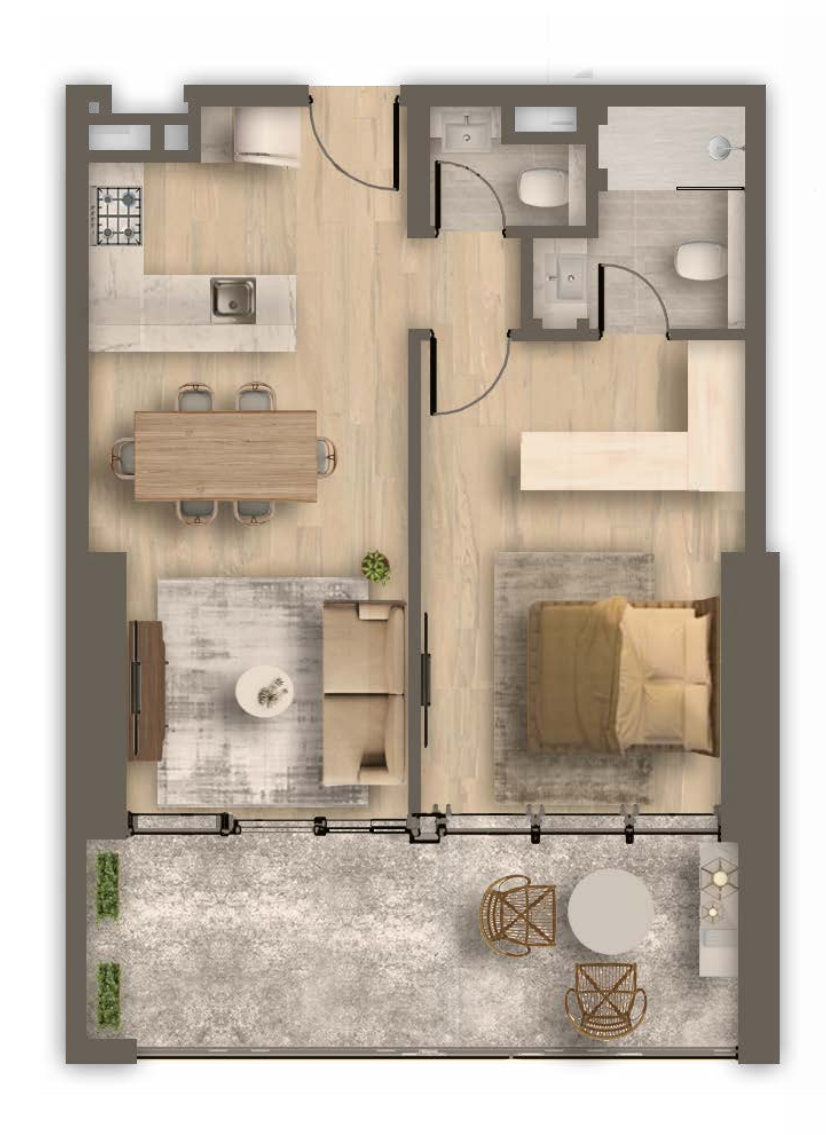
Type A From 654 sq.ft to 796 sq.ft