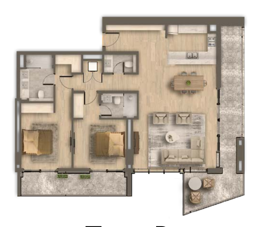
Type B From 1,467 sq.ft to 1,677 sq.ft