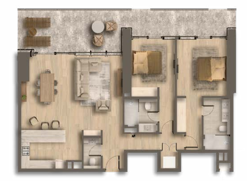
Type C1 From 1,470 sq.ft to 1,617 sq.ft