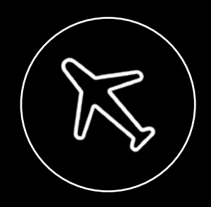
15Min Dubai Airport