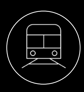
5Min Metro Station