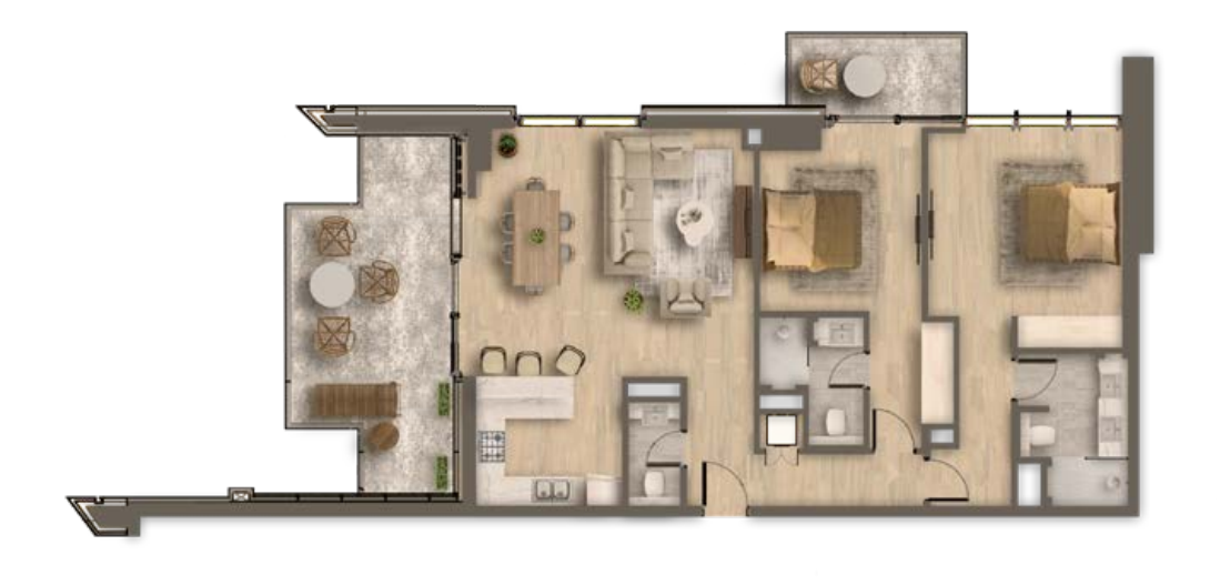
Type C From 1,321 sq.ft to 1,487 sq.ft