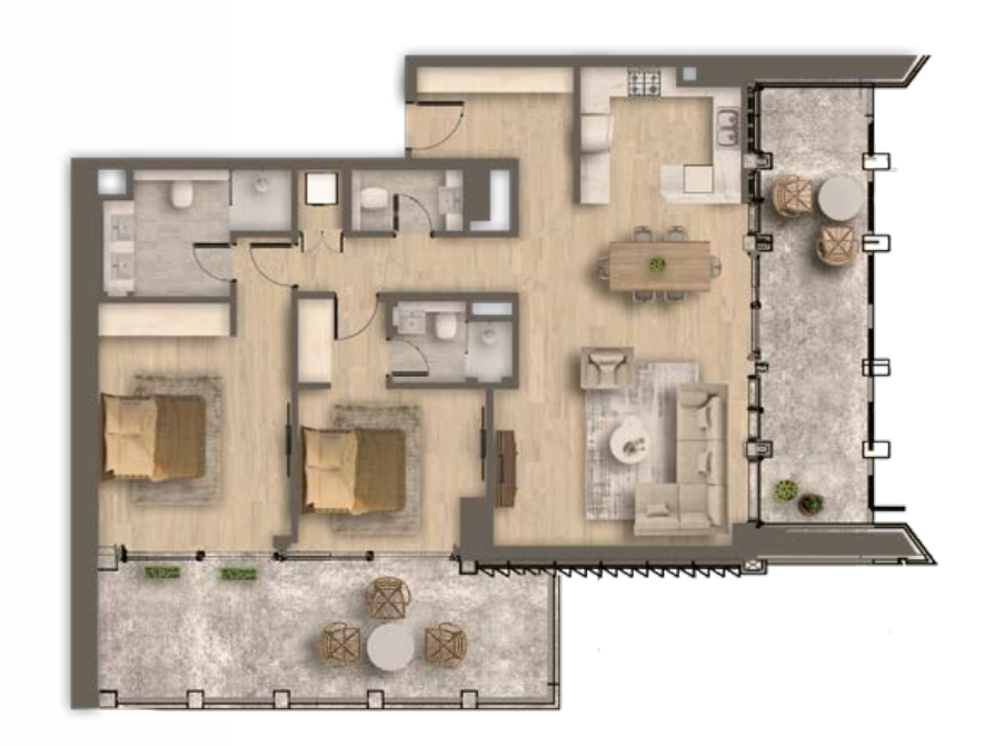
Type D From 1,275 sq.ft to 1,698 sq.ft