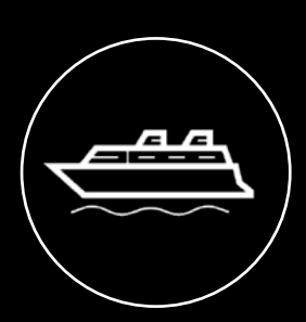
20Min Dubai Marina