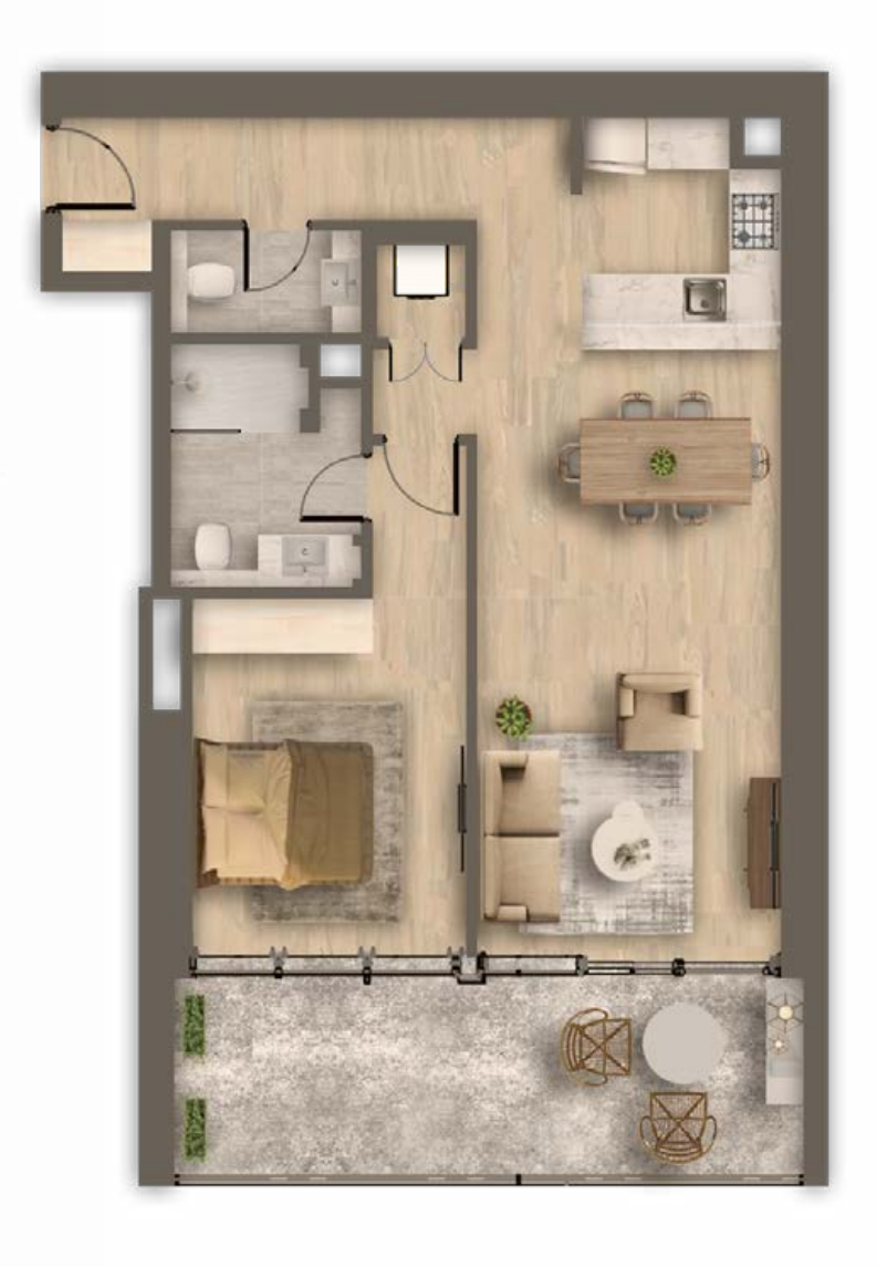
Type B1 From 996 sq.ft to 1,013 sq.ft